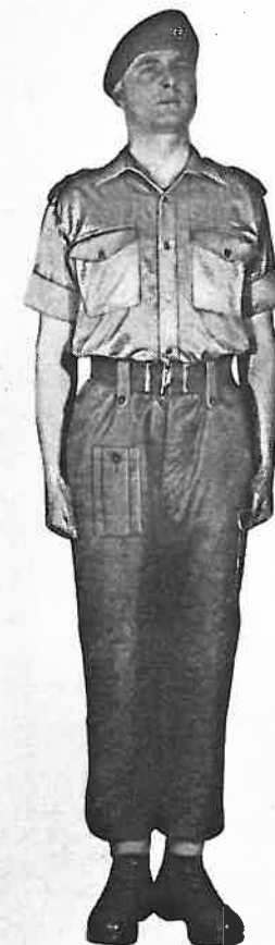
No. 12 Dress