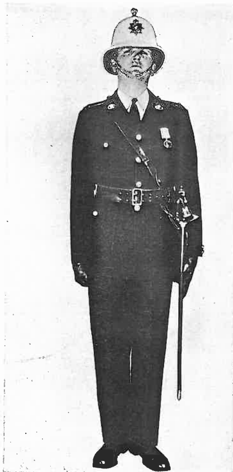
No. 1 Dress No. 4 Dress: (with cap)