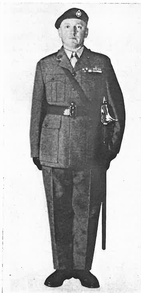
No. 5 Dress