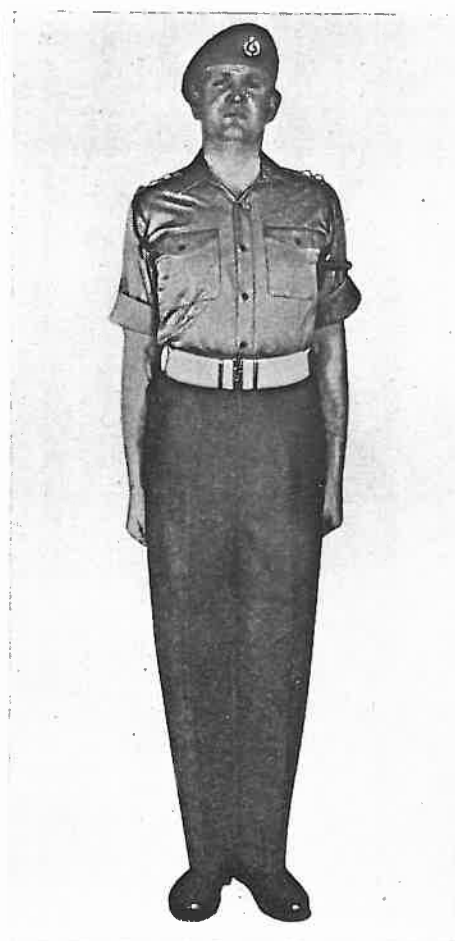
No. 13 Dress