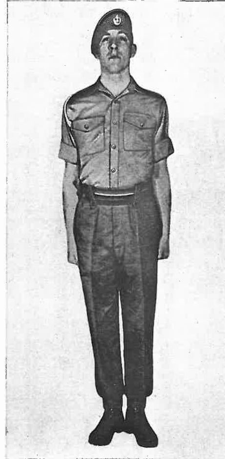
No. 8A Dress No. 12 Dress: (with web belt and short puttees)