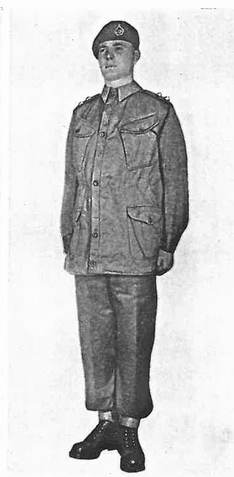
No. 11 Dress