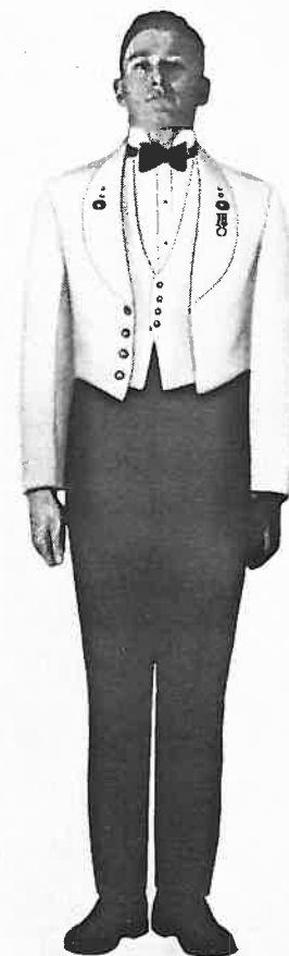
Nos. 2W & 6W Dresses No. 7 Dress: (Scarlet kamar-band instead of waistcoat)