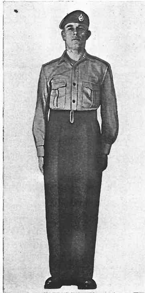
No. 8 Dress