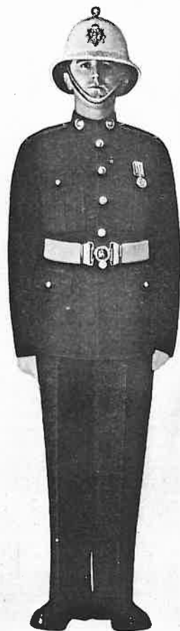
No. 1 Dress No. 2 Dress: (with cap and without white gloves)