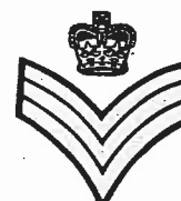
Sergeant (for other dress)