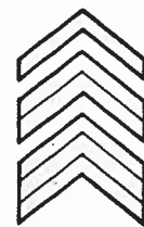
Good Conduct Badges