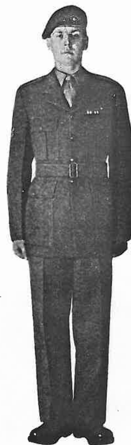
No. 3 Dress: (white belt) No. 4 Dress: (cloth belt)