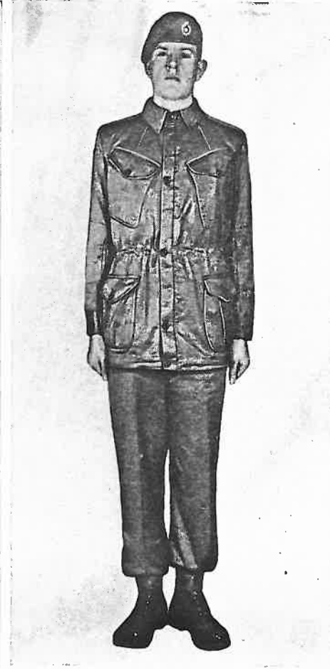
No. 11 Dress