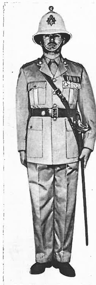
No. 1W Dress No. 4W Dress: (with cap)