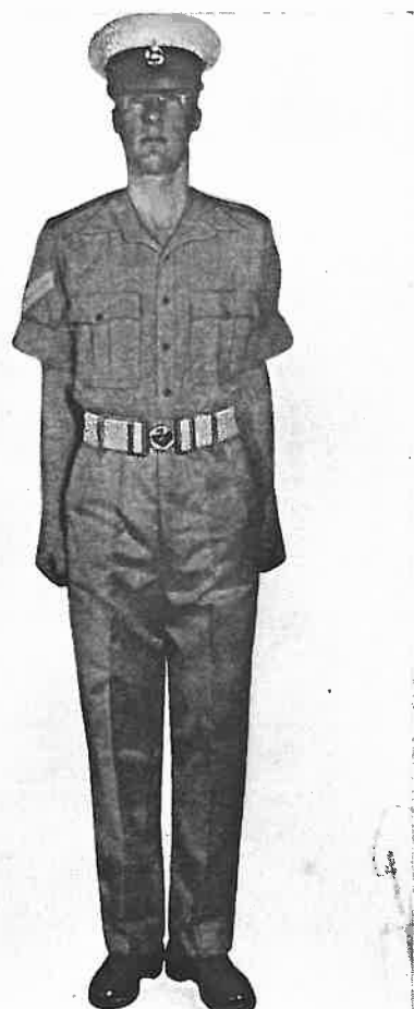
No. 7 Dress