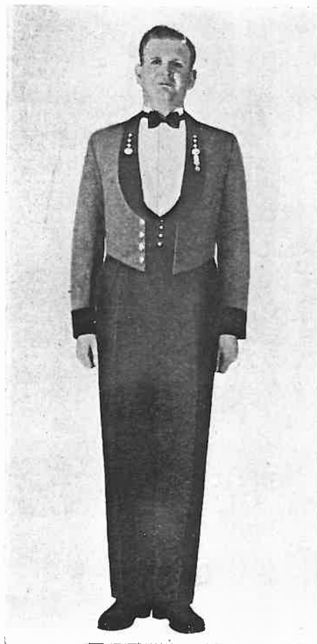
Nos. 2, 6 & 7 Dresses