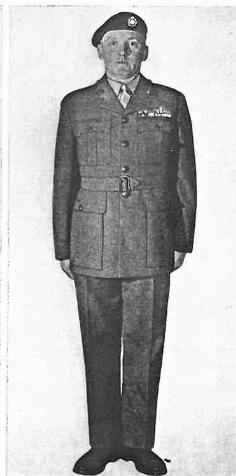
No. 8 Dress