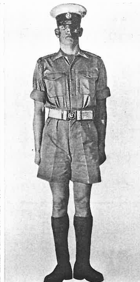
No. 10 Dress No. 10B Dress: with sandals and blue or Corps pattern belt