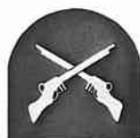
Drill & Platoon Weapons