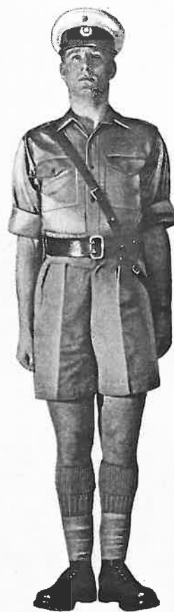
No. 8W/9W Dress